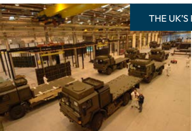
THE UK'S HX FLEET

Marshall Land Systems is credited with delivering or supporting a number of platforms in service today, both within the UK MoD and globally. Examples include the UK's MAN HX SV Fleet, Land Rover Ambulance and C2 variants, Land Ceptor's Fire Unit Support Vehicles and the Boxer Ambulance variant. Most recently, Marshall have delivered the UK's new C-EOD fleet known as GASKET,