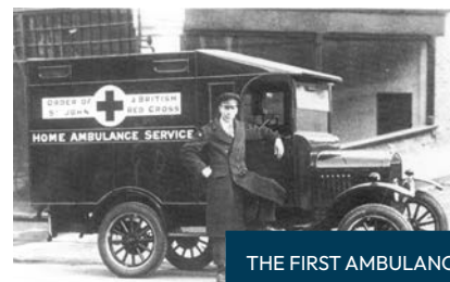
THE FIRST AMBULANCE

A rich heritage of platform systems delivered in the time since includes Special Forces Land Rover variants such as the Pink Panther, Recovery Systems, Equipment Transporters and Light Anti-Tank Conversions. Across the years, there is barely a household platform provider with whom Marshall hasn't collaborated.